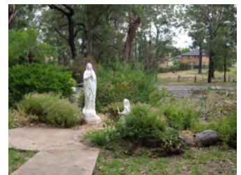
The grotto area today.

When the project is completed the area will offer a peaceful and reflective space for visitors.