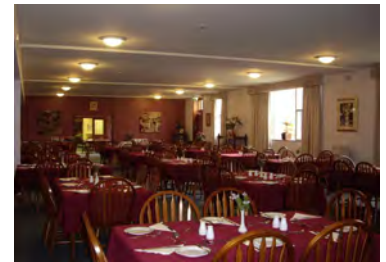
The Dining Area

as a service to the people of God and as an appropriate stewardship of the goods of the Congregation of the Sisters of St Joseph.