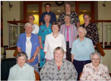
New Voices Participants 2008