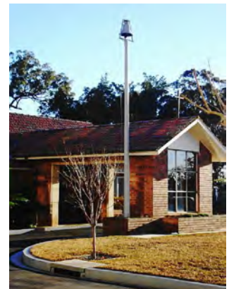
Entry to the Ryan